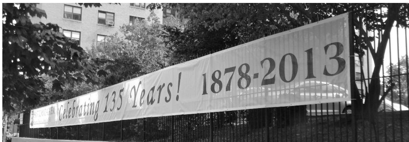
A 90-foot banner drapes the school's front gate in celebration of its milestone anniversary.

Academy continues its mission of empowering women