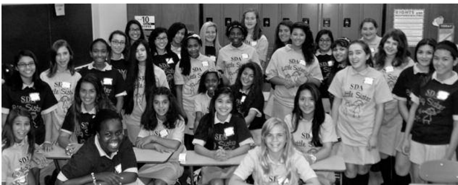
Saint Dominic Academy's 7th and 8th grades had their official and successful opening on Thursday, September 5, 2013. The school's youngest students were enthusiastically welcomed by their "Big Sisters."

principled education for our 7th and 8th grades.