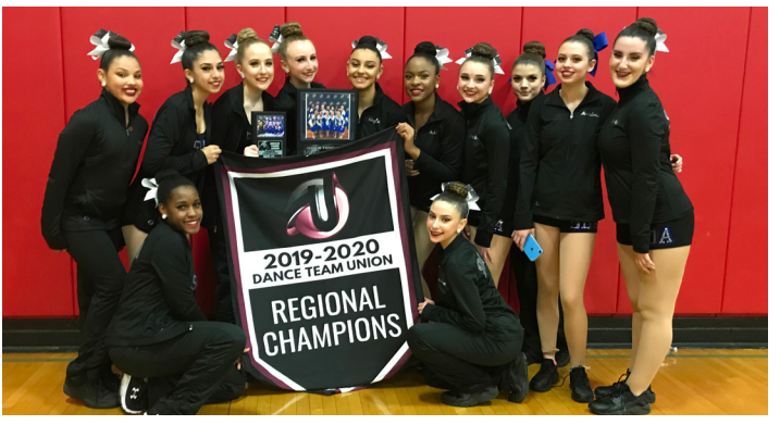
Congratulations to our dance team on their win at DTU Regional Championship!