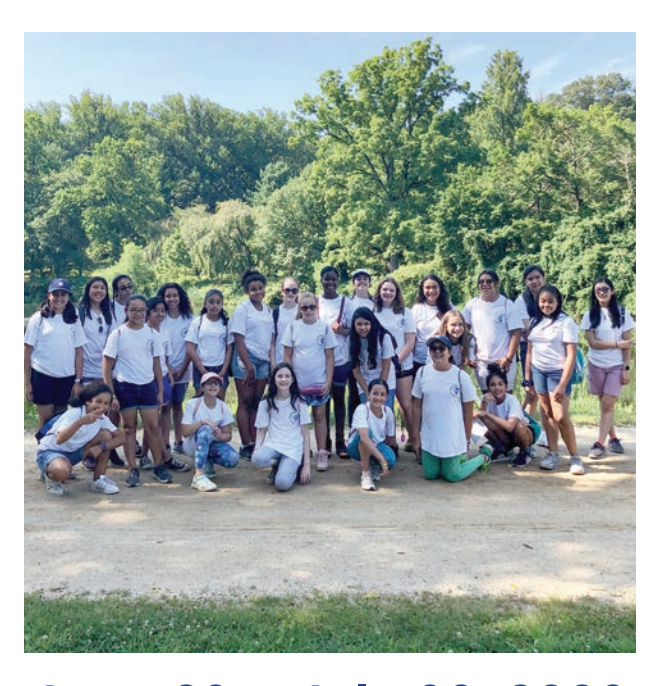
June 29 —July 30, 2020

Summer Program and HSPT® Prep for girls entering grades 4-8