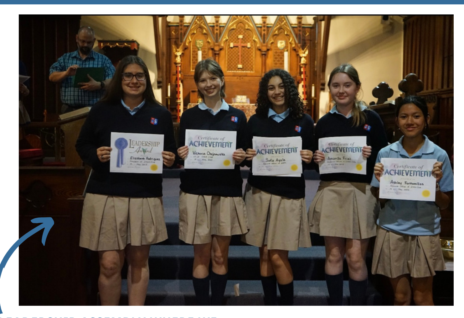
SWORE IN NEWLY ELECTED CLUB EXECUTIVE BOARDS